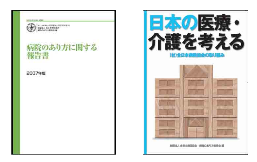
Figure 2: "What hospitals ought to be-Report of the Committee on the Future of Hospitals, 2007" (left) and "On medical care and long-term care in Japan-A message from the AJHA Committee on the Future of Hospitals to the Japanese people, 2008" (right)

The Committee on the Future of Hospitals is composed of the chairpersons of all committees and mainly discusses how the healthcare system and hospitals in Japan ought to be. The results of these discussions are summarized every 2 years in the publication called "What hospitals ought to be- Report of the Committee on the Future of Hospitals". These reports describe the direction and activities expected of each committee in the following 2 years. In 2008 the report was rewritten and published as "On medical care and long-term care in Japan-A message from the AJHA Committee on the Future of Hospitals to the Japanese people, 2008" so that the general public had access to the information as well.