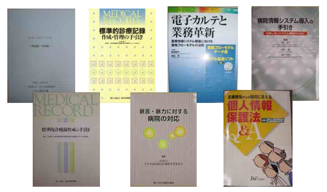
Figure6: Recent Publications

On medical care and long-term care in Japan -A message from the AJHA Committee on the Future of Hospitals to the Japanese people, 2008