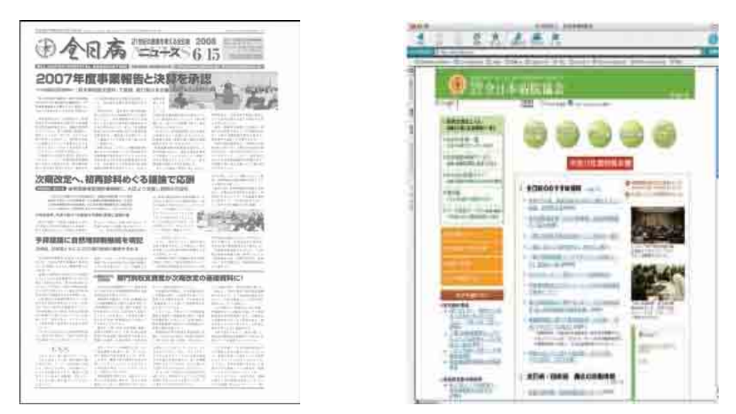
Figure5: AJHA News(left), and AJHA homepage(right)

To provide appropriate information timely, the AJHA publishes the newsletter "AJHA News" to its member hospitals every 2 weeks and maintains its own website: http://www.ajha.or.jp/