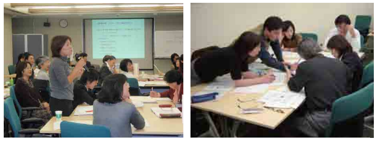
Figure4: Education courses for Nursing Managers(left), and for Managers(right)

Safety and Risk Managers Supervising of clinical training Annual check-ups and health consultations Personal Information and Information Officers Prevention of disaster damage